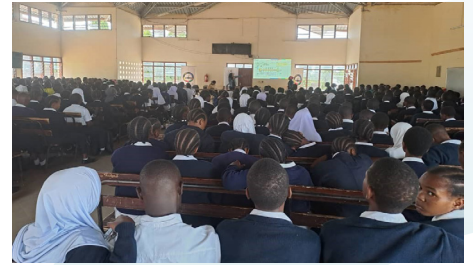
Singida Region (VETA): 442