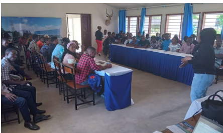
Mwanza Region (DIT): 53