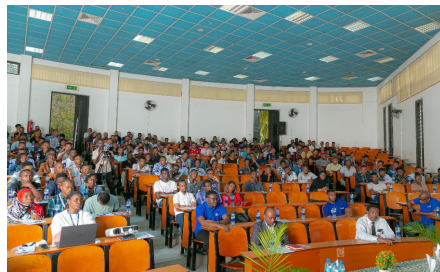
Dar es Salaam Region (University of DSM): 1000+