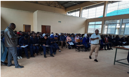
Manyara Region (VETA): 160