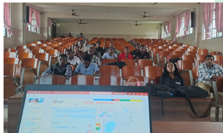
Dar es Salaam Region (St. Joseph University): 17