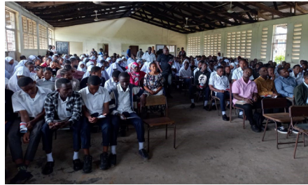
Tanga Region (VETA): 391