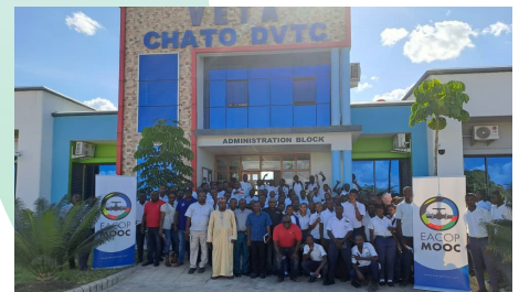
Geita Region (VETA Chato): 561