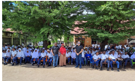
Dar es Salaam Region (VETA Chang'ombe): 1000+