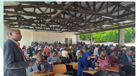
Dar es Salaam Region (Bandari College): 195