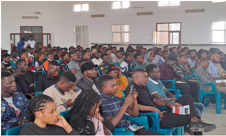
Dodoma Region (University of Dodoma): 221