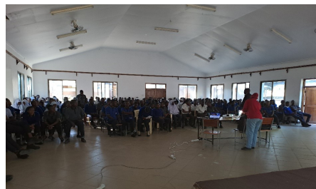
Tabora Region (VETA): 245