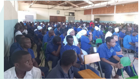
Kilimanjaro Region (VETA): 500+