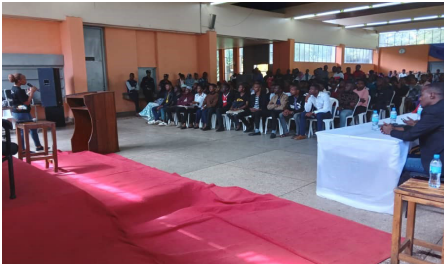
Arusha Region (Arusha Technical College): 400+

In line with EACOP's commitments on Local Content and specifically on reaching the youth along the pipeline construction and operation areas, EACOP has developed and launched a Massive Open Online Course (MOOC) on the 5th of June. Members of the Local Content team alongside EACOP COMMS Tanzania, Marine Storage Terminal (MST) and Field Operations, embarked on a MOOC Campaign over 23 days covering +3,000 kilometers across project regions and including Mwanza, Arusha, Kilimanjaro and Dar es Salaam where over +9000 potential applicants were engaged. Here are highlights of the events and their respective attendance numbers.