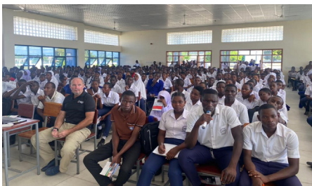
Shinyanga Region (VETA): 500+