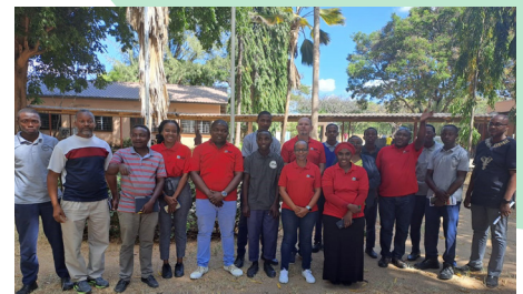
Dodoma Region (VETA): 260