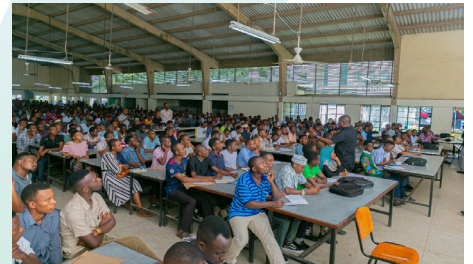
Dar es Salaam Region (DIT): 1500