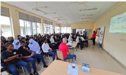
Dar es Salaam Region (VETA KIPAWA): 67