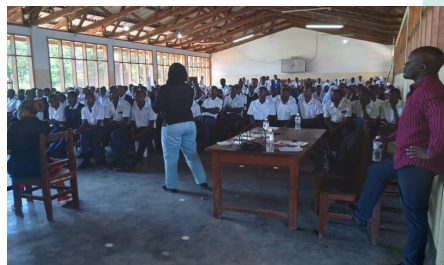
Mwanza Region (VETA): 161