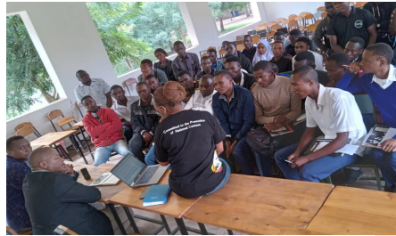
Arusha Region (VETA): 150