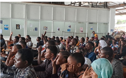
Dar es Salaam Region (DSM Maritime Institute): 307