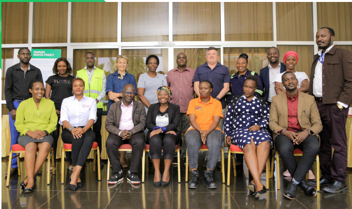
Human rights training in Kampala and the field for staff and contractors.