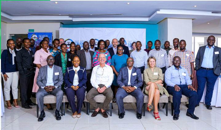
CSCO quarterly engagement October 2022