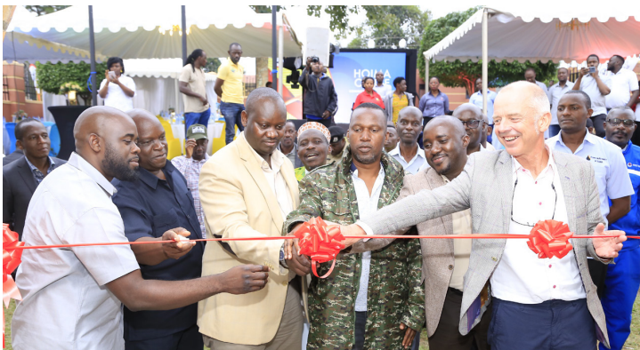
Hoima office opening with key leadership members from Hoima District Local Government, MEMD, PAU, TotalEnergies and UNOC