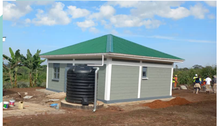
Progress of housing construction